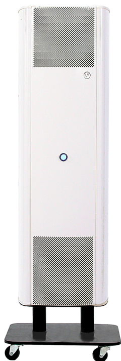
Wheeled model (-ST)

UV-FAN is ready for use and does not require any special maintenance except for the periodical replacement of the lamps, it is entirely built in Italy, with high quality and extremely resistant materials.