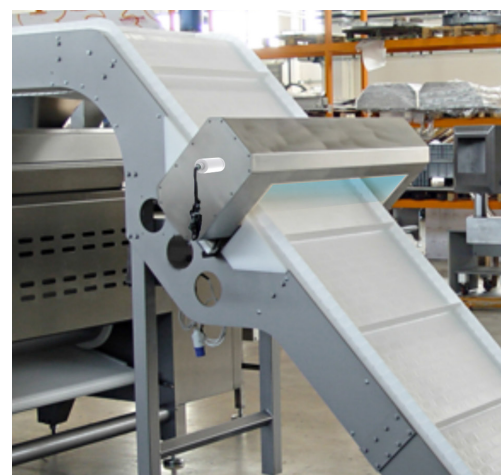
Application in an industrial environment

UVGI technology is a physic disinfection method with a great cost/benefits ratio, it's ecological, and, unlike chemicals, it works against every microorganisms without creating any resistance.