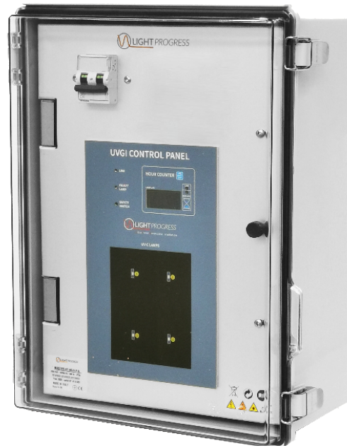
TABLE - Tabella