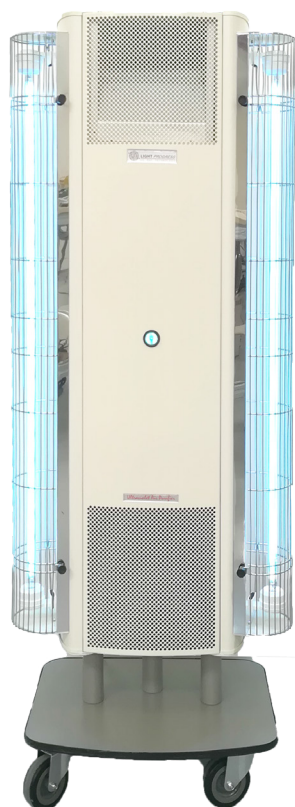
Wheeled model 2BD-ST-Rc2

UV-FAN series includes a wide range of wall or wheeled (model -ST) purifiers, different according to the UV-C lamps power and size.